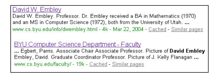
Figure 3: Two Citations that have the Same Host, www.cs.byu.edu.

popularity is dynamic and changes over time. Another solution, which we decided to adopt, is to find the number of pages that point to a host. The query link:siteURL in Google shows all pages and gives a count of the number of pages that point to that URL. For example, link:www.google.com shows and counts all the pages that point to Google's home page. (Without having a simple way to obtain this count, it would be unreasonable to rely on this number.) We determined empirically that a host h is popular for person-name queries if more than 400 pages point to h .